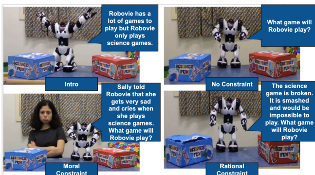
Figure 1: Screenshots of video stimuli used in the robot condition. Participants watched a short introduction video and then proceeded to view three Constraint scenario videos. Videos in the human condition were identical, with the exception of a child in place of the robot.

Across all three constraint scenarios, action predictions were explored by running an omnibus binomial test to determine whether the percentage of game prediction (default and alternative) differed from chance (50%). The percentage of the default game predicted was marginally lower than chance in the human condition ( p = .059 ) and at chance in the robot condition ( p = .665 ). A Mann-Whitney test indicated that the default game prediction did not differ by agent condition ( U = 1032, p = .301, r = .182 ). Within each of the three constraint scenarios, action predictions were explored by running binomial tests to determine whether the percentage of game prediction (default and alternative) differed from chance (50%). Further, Mann-Whitney U tests were run to test for